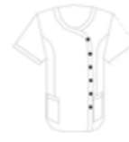
N2025 SS R-neck tunic with buttons & pockets