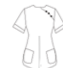
BL3047 SS R-neck tunic with pockets