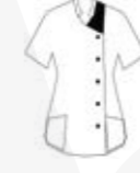
N2021 SS tunic with contrast feature & pockets