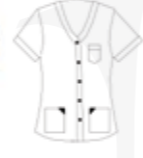
N2024 SS V-neck tunic with buttons & pockets