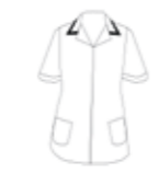
N401 SS tunic with tipped contrast, pockets & zip