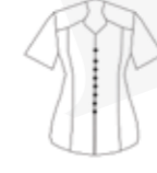
B1138 SS tunic with buttons & pockets