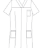
N2015 SS V-neck dress with pockets