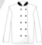
JK0033 Unisex chef jkt