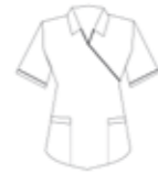
N100 SS Tunic with mock cross & pockets