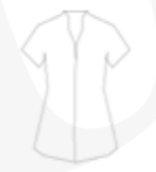
N2011 SS Tunic with zip detail