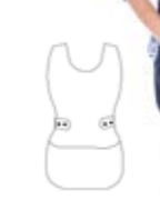
BL1166 Tabard with buttons & pockets