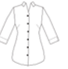
B405 Basic 3/4 slv stripe shirt