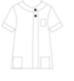
N2013 SS R-neck tunic with buttons & pockets