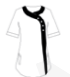
N190 SS R-neck contrast tunic with pockets