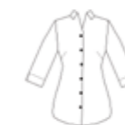
B405 Basic 3/4 slv ptd koshibo shirt