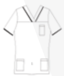
N2018 SS V-neck tunic with contrast & pockets