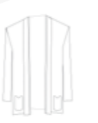
BL2375 LS cardigan with pockets