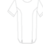
B68 SS R-neck tunic with 2 front slits