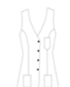
BL1164 V-neck gilet with buttons & pockets