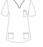
N105 SS Tunic with V-neck & pockets