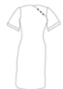
BL3048 SS R-neck dress with back zip