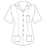
N110 SS tunic with buttons & pockets