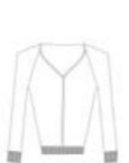
BL3203 LS button front cardigan