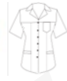
N2023 SS Tunic with buttons & pockets