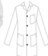
N2006 Unisex lab coat